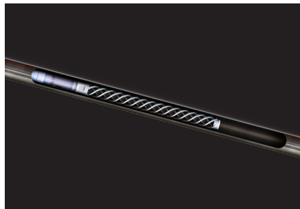
SPIN® for wireline retrievable down hole safety valves (single run)