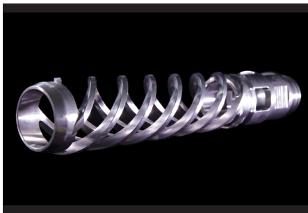
SPIN® for installation inside tubing retrievable down hole safety valves

SPIN® is available for tubing retrievable DHSVs, wireline retrievable DHSVs and as a sub upstream DHSVs for integration in the production tubing